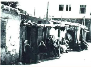
رجال سحمتا في مخيم تكتة غورو - القسلة - بعد التكتة عام 1950

تقولك سيدتي ... يا زهرة ياسمين بركة يا هوايا الغليل يا تروشا في الجليل أحييناك ... فلم نعرف كيف نحب هجرناك ... لبنال الدل منا ... تأثينا ... حائرين ... فرحين! لا ... نملك باتسين ... بل ... ورب الكعبة ... عائدون