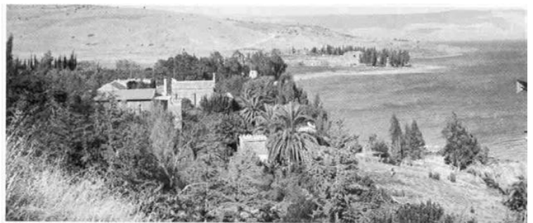
26. The Arab village of Et Tabigha, Tiberias Sub-District, on the Sea of Galilee. In 1948 all its 330 inhabitants were expelled and it was erased from the map. Its 5,389 dunums of land were usurped by Jews.