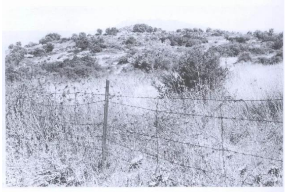
البل الذي كانت قرية كفتا (الحليل) تقوم عليه. (حزيران/يونيو ١٩٩٠)