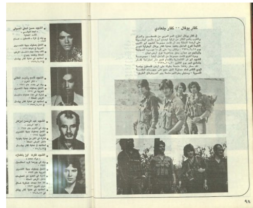
Kafar Yuval Operation | El-Jalil, an Arabs' land just as the rest of Palestine