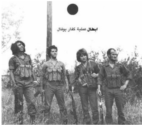
Kfar Yuval operation (Operation Grapes of Wrath)